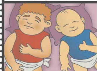
Rivka gave birth to twins – Esav and Yaakov.