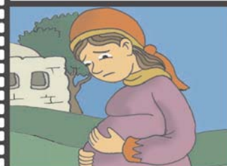
When Rivka finally got pregnant, she felt that the babies were "fighting" within her.