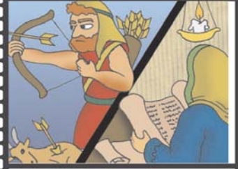
Esav was a hunter, a man of the field, while Yaakov sat in tents.