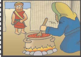
Yaakov had prepared a stew, and Esav came back tired from the field.