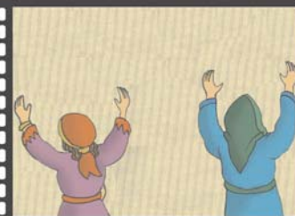
Yitzchak and Rivka did not have any children, so they prayed to Hashem.